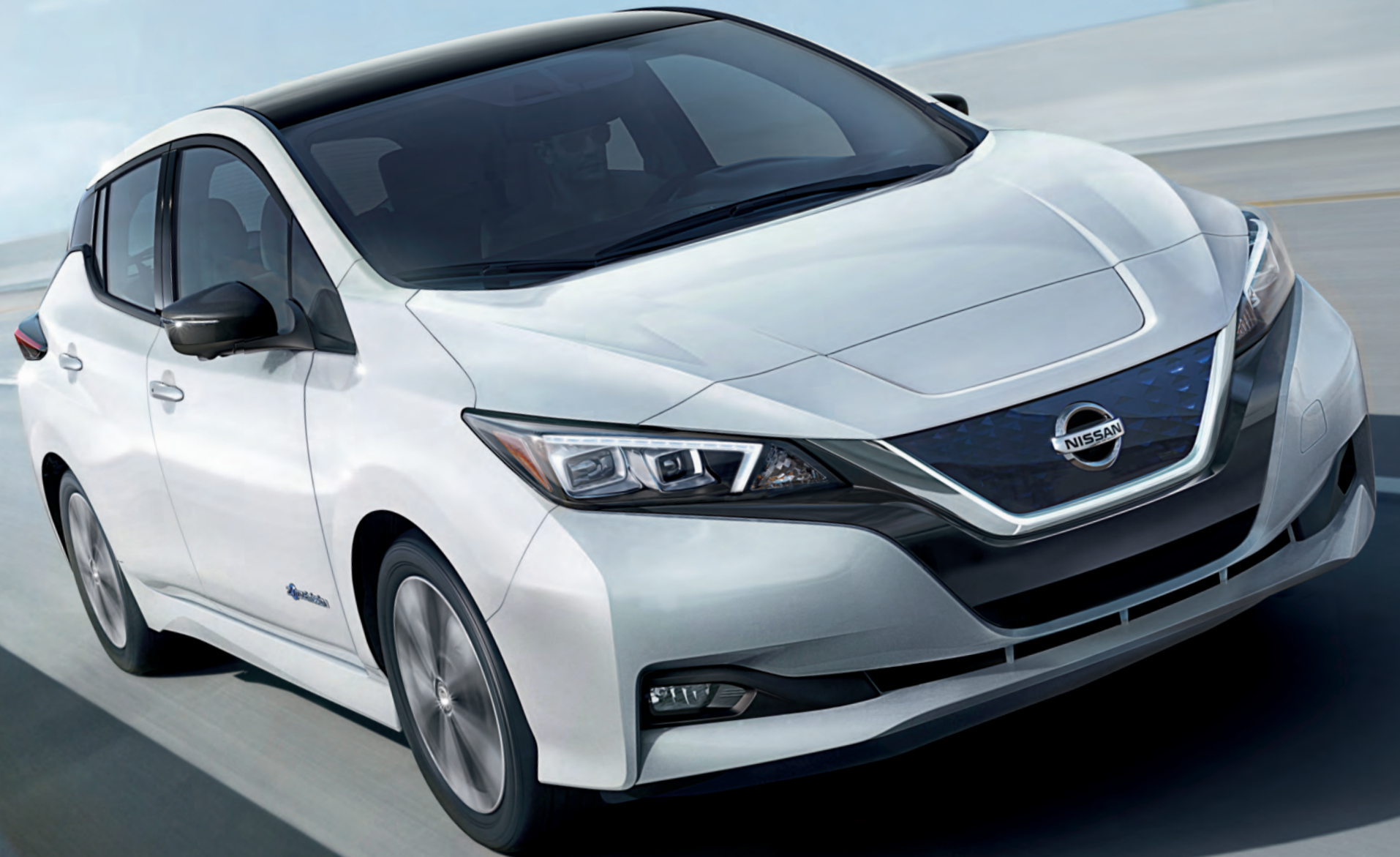
Nissan LEAF® SL shown in Two-tone Pearl White/Super Black.

A powerful step forward for Nissan's 100% electric vehicle. Get ready for a whole new way to drive, where the everyday is exhilarating. Feel more confident, excited, and connected – wherever you go. All in a car that does simple things amazingly.