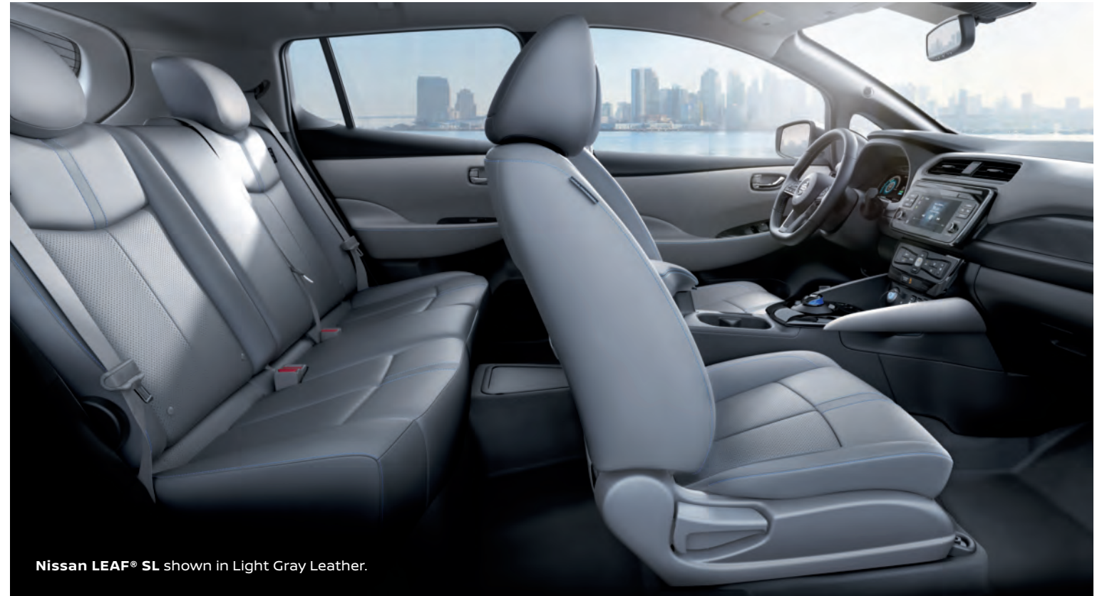
Nissan LEAF ® SL shown in Light Gray Leather.