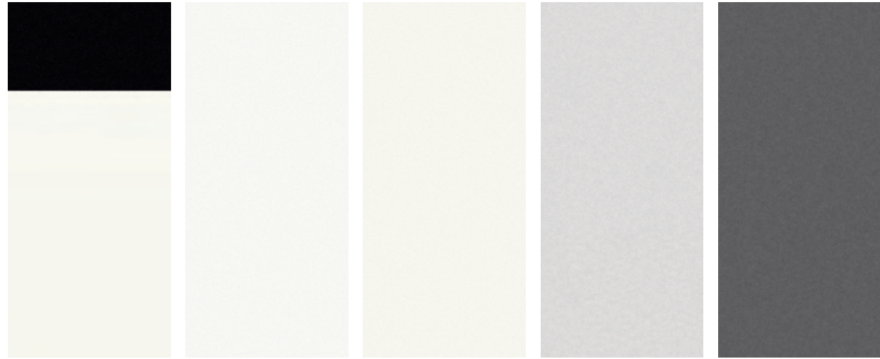
Two-tone Pearl White/ Super Black 13 XBJ